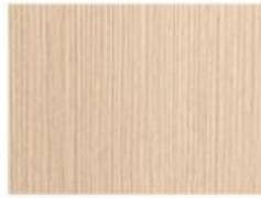
SOLID WOOD GRAIN 1