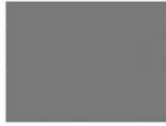
SKIN FEELING MEDIUM GRAY