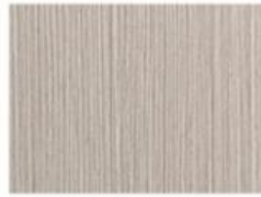
SOLID WOOD GRAIN 2