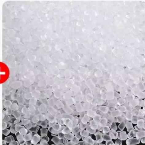
Polymer crystal materials