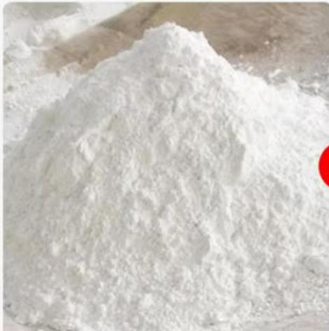
Natural stone powder