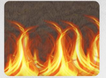
Fire retardant B1 level fire protection, home decoration and tooling fire protection pass the standard