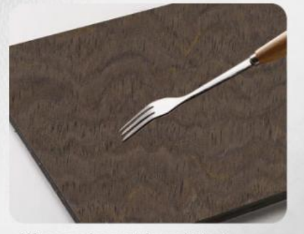
Wear and scratch resistant Thick film paper without leaving any marks when bumped

Compression resistant and non deformable PUR hot melt adhesive film covering