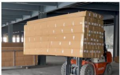
Nearly 10 years Industry experience