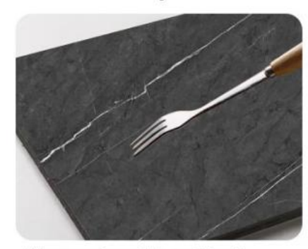
Wear and scratch resistant

Compression resistant and non deformable PUR hot melt adhesive film covering