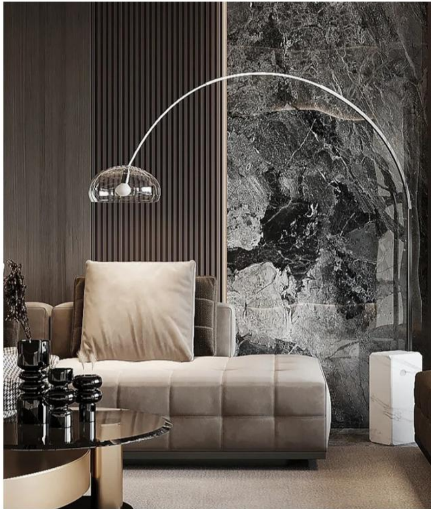
PVC WALL PANEL