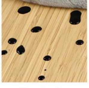
Easy to clean