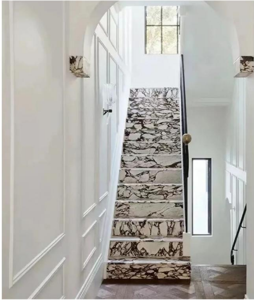
PVC WALL PANEL