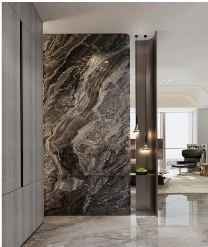
PVC WALL PANEL