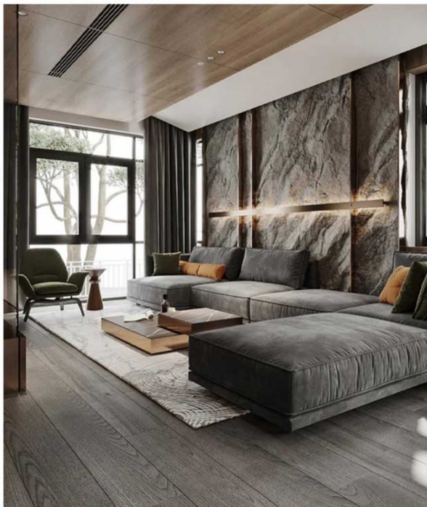
PVC WALL PANEL