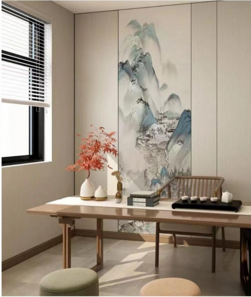
HOME DECORATION WALL