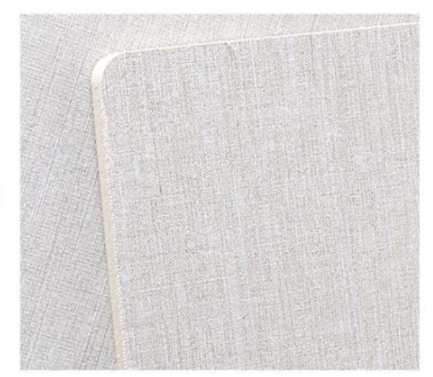
Ramah lingkungan Tahan aus dan tahan lama