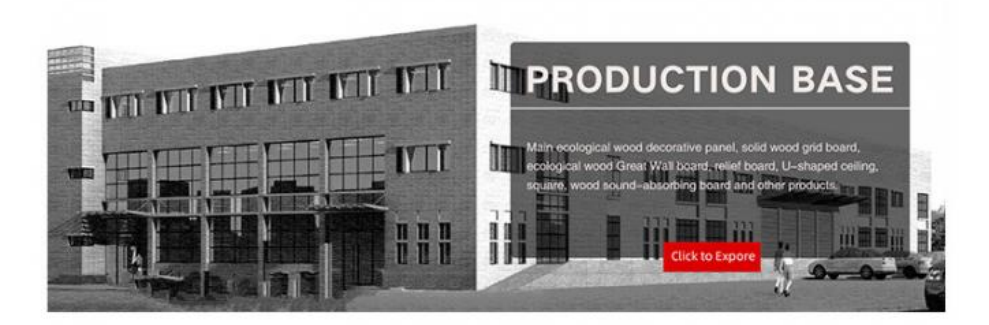
HIGH-END CUSTOM WOOD VENEER